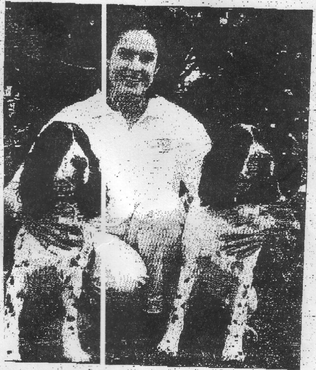
Next time you go on holidays, let a Don't Fret Pet! minder care for your beloved dog.